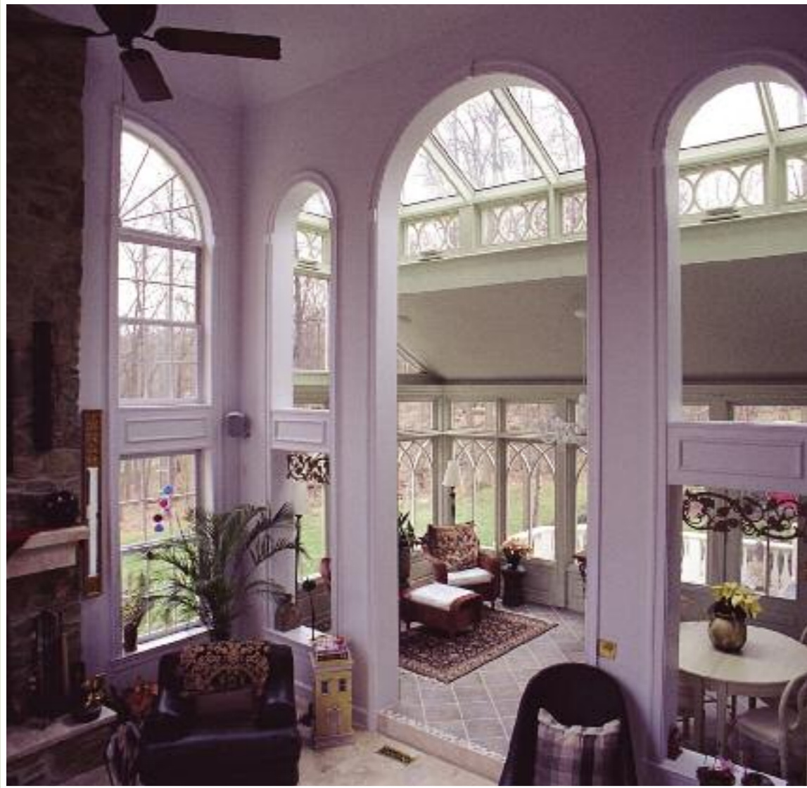
Renaissance Design Team