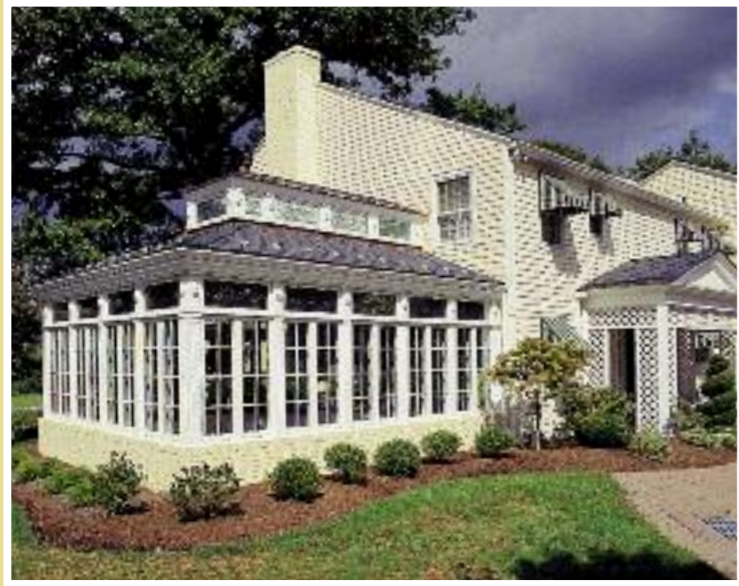
Renaissance Design Team

A verdant bower trails across the ceiling, breathing life into this magical Garden Room. Crystals and leaded glass twinkle in the soft diffused light. The music of the Ohio River, far below, floats up the hill and mingles with the gentle murmur of the natural world, transporting us to a simpler time.