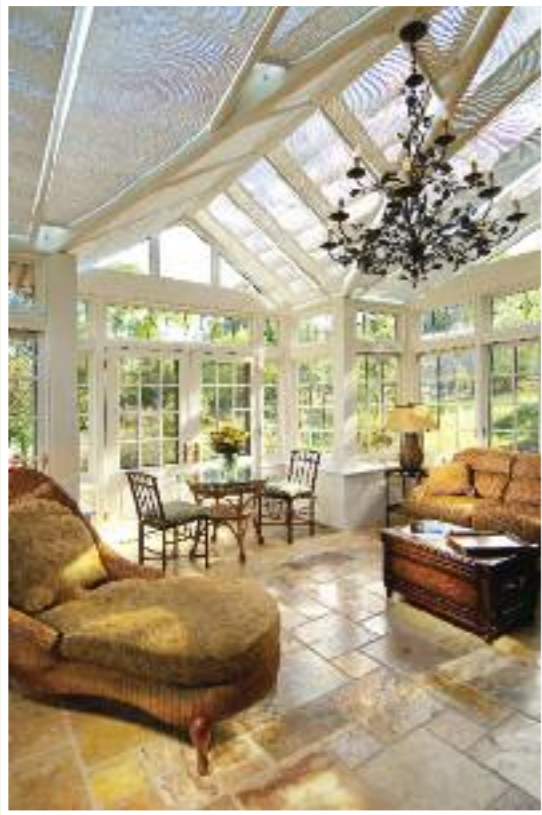
Peter Zimmerman Architects