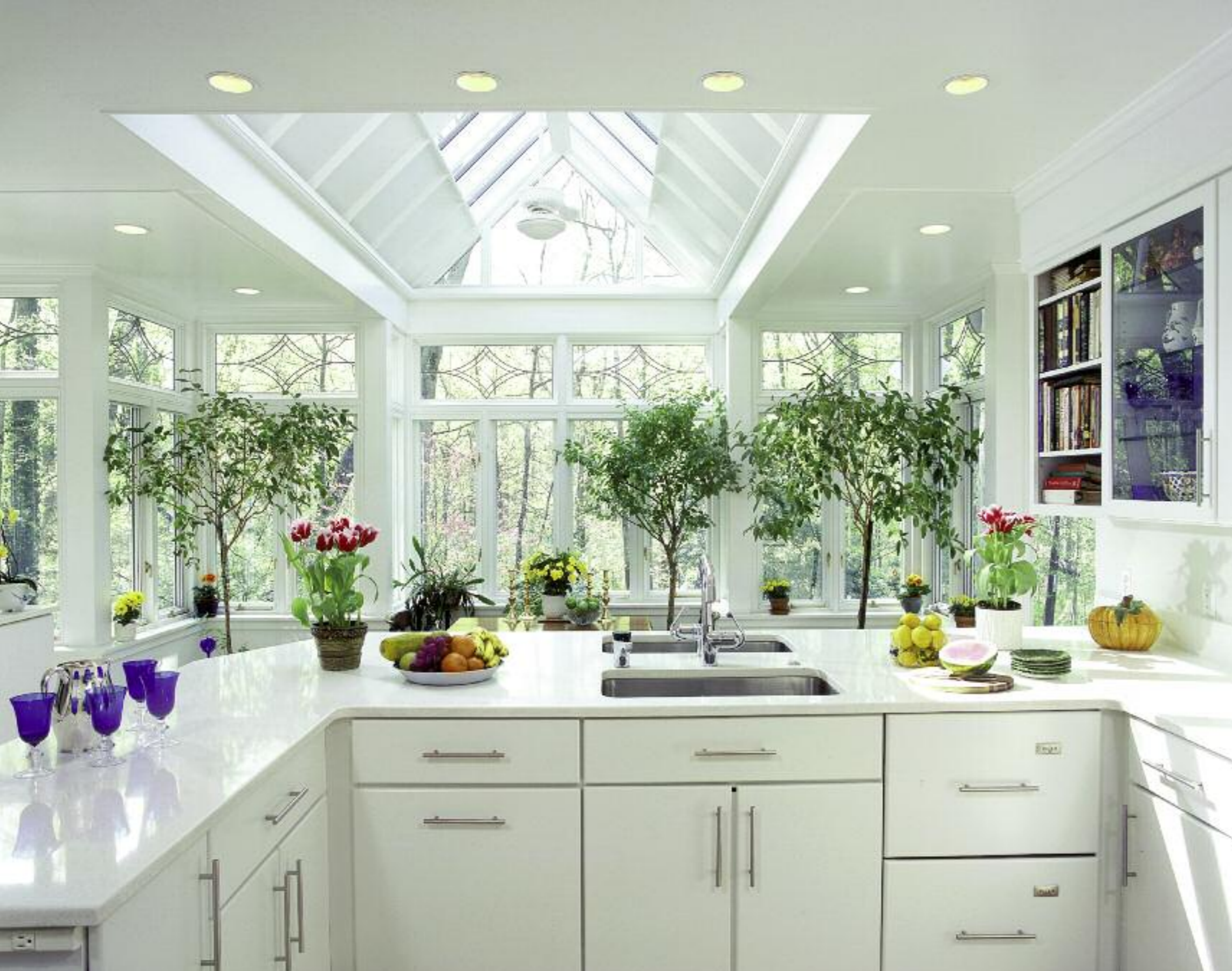
Renaissance Design Team Smith, Thomas & Smith, Inc.