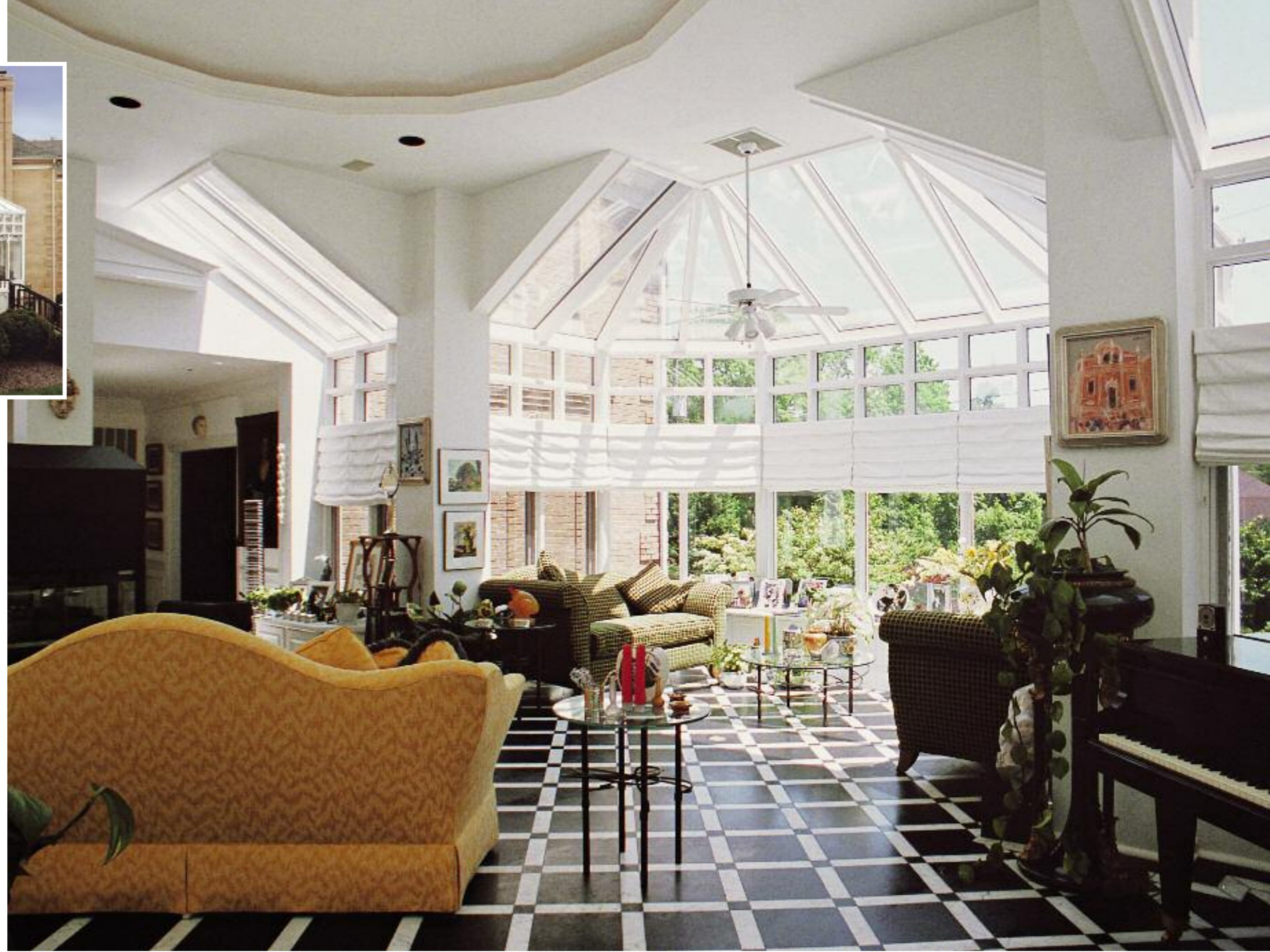
Caroll C. Curtice, A.I.A.

Strains of Chopin echo across the marble floors and drift onto the patio and rose garden beyond...music to stir the soul... music for living.