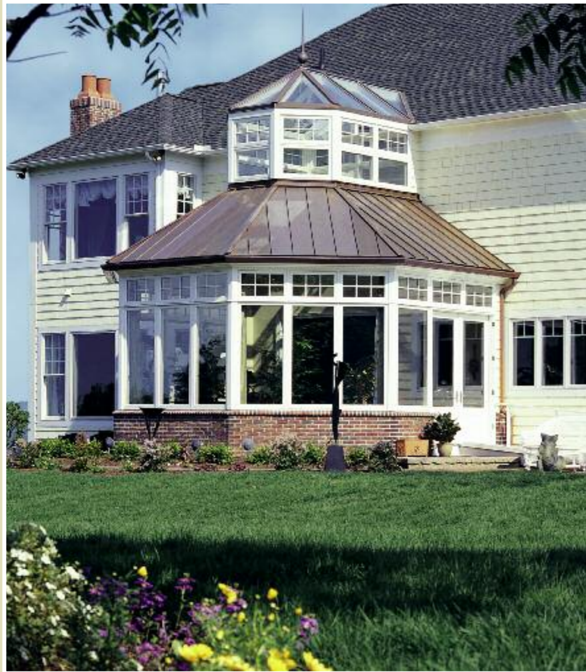
Architectural Innovations, PC Ketmar Development Corporation

H ear the lingering strains of music permeating bath and salon in this showcase home for the Rochester Philharmonic Symphony.