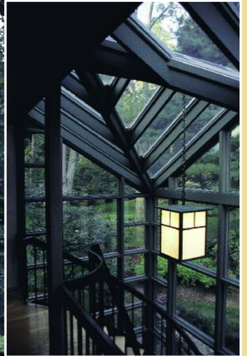
Renaissance Design Team

Enjoy the lantern's glow. Trace its pool of limpid light onto the garden path, into the dewy, starlit night.