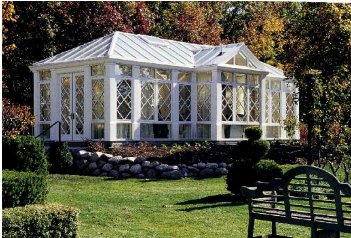
Renaissance Design Team

No dream perchance...in this working artist's studio, with its glistening diamond paned glass walls, mirrored in the adjoining garden's pear espalier.