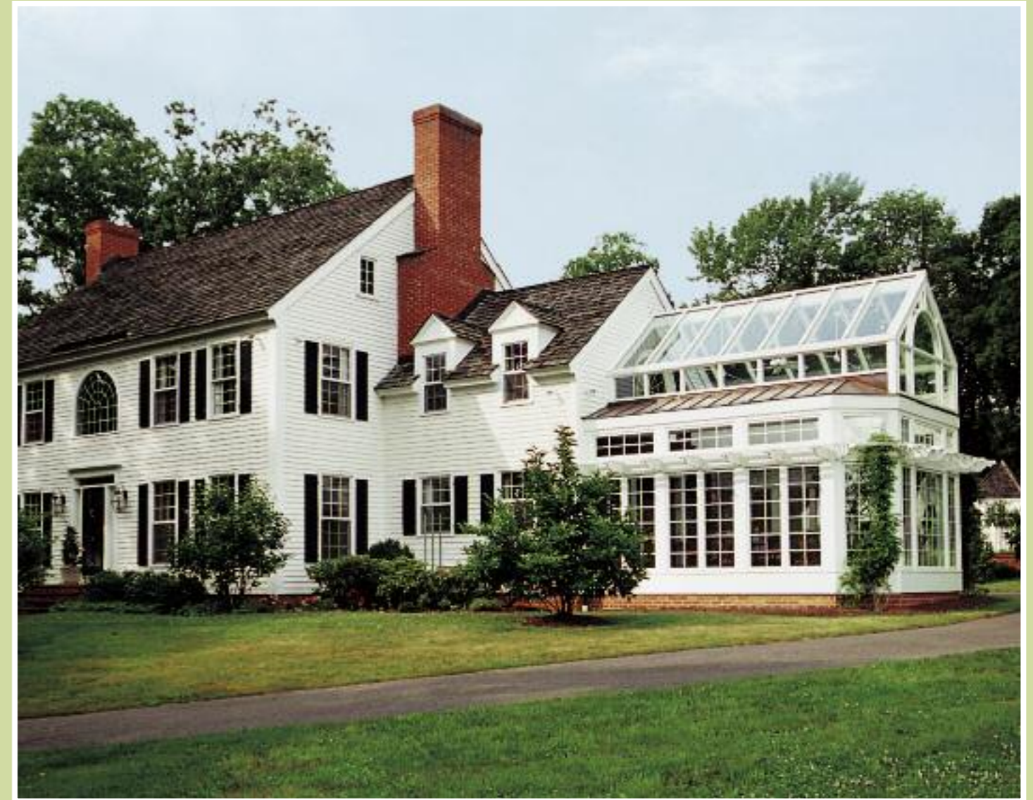
Pat Burke, A.I.A.

Light, God's eldest daughter, is a principal beauty in a building.