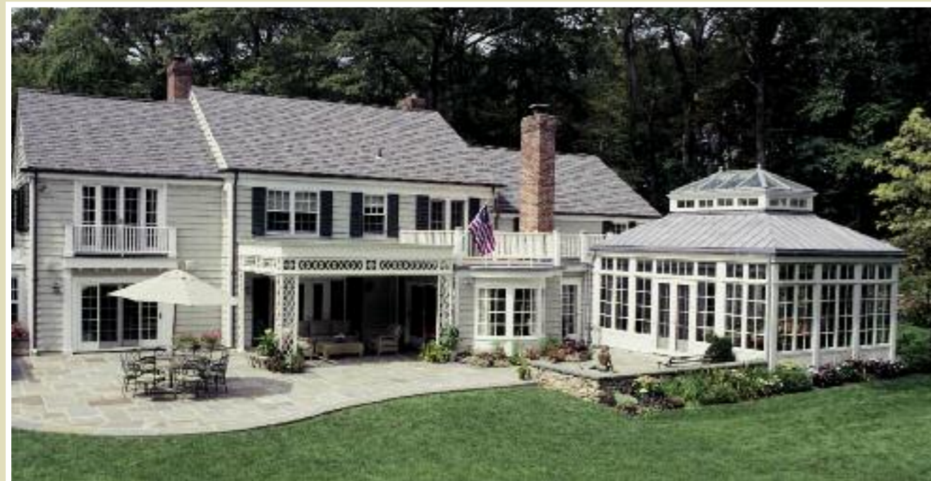
Kenneth W. Dowd, Innocenti & Webel

F eel the sweet warmth of sun kissed marble beneath your feet. Dappled light illumines this cozy, welcoming space, inviting the family to luxuriate in comfort.